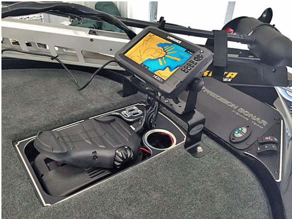
Bow Mount Sonar Bracket (Tall) & Bow Replacement Panel

Precision Sonar has sonar accessories for most makes and models of boats be sure and visit our website and look at the photo gallery