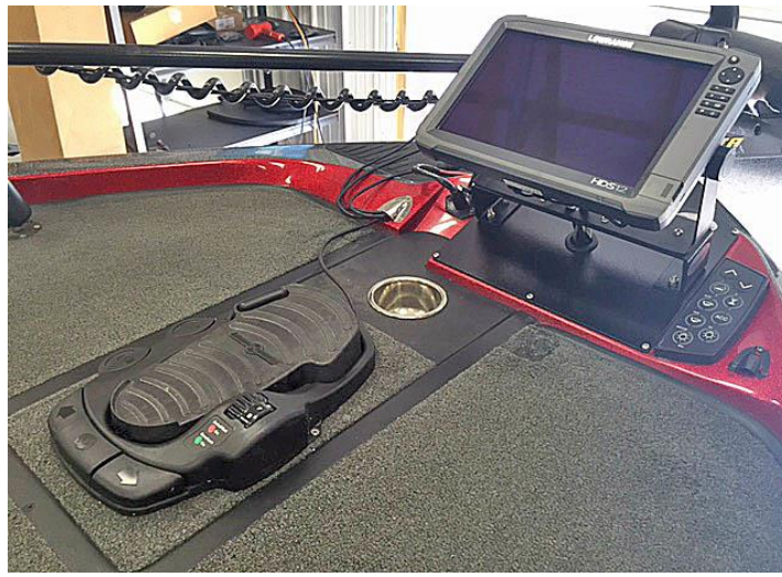
Precision Sonar U-Bracket Bow Mount & Replacement Panel on a Ranger C Series boat.