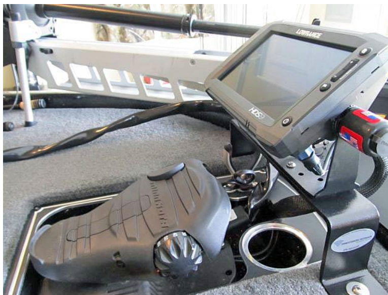
Bow Mount Sonar Bracket On a Skeeter 2015 ZX