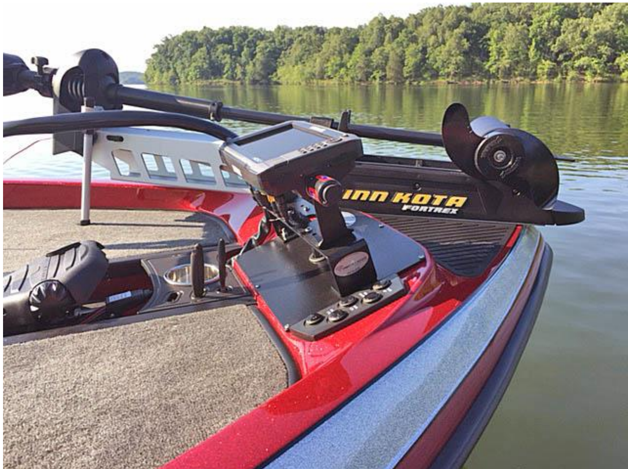
(2015 Ranger 119 C.)

Precision Sonar U-Bracket and Replacement Bow Panel.