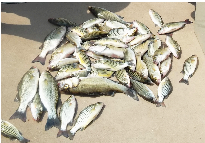
(Photo) The Matt Letexier group from Indianapolis with some good white and yellow bass caught from the 'toon

Crappie ... Capt. Rich has been trolling SPRO cranks deep 16-19 feet and catching some big post-spawn females. The bite has been very consistent for big crappie and the numbers have been good each day. Book your trip NOW!!!