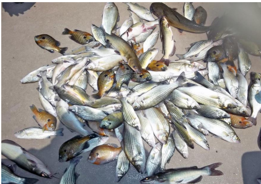
The Marty Elder group from Sellersburg, IN (Photo) had a fantastic trip fishing from the Kick'n Bass Pontoon. Their mixed catch included crappie, white bass, bluegill, redear, yellow bass, catfish, and largemouth bass.

Crappie ... Capt. Rich has been trolling SPRO cranks deep 16-19 feet and catching some big post-spawn females. The bite has been very consistent for big crappie and the numbers have been good each day. Book your trip NOW!!!