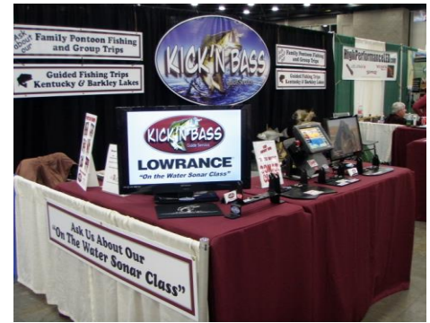
(Center Photo) Bill Hurle, Kim Muncy (Show Director) & Randy Kuhens owner of Kick'n Bass

Lake Conditions – Early this morning the boat ramps located here on the North end were still iced in. Also the bays have a significant amount of ice in them. The boat ramp at Fenton next to the Hwy 68 Bridge is open. If you launch and decide to venture out do so at your own risk and proceed with caution. Remember, always wear your PFD and advise others of your plans.