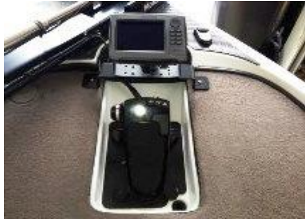
Triton Bow Mount Bracket