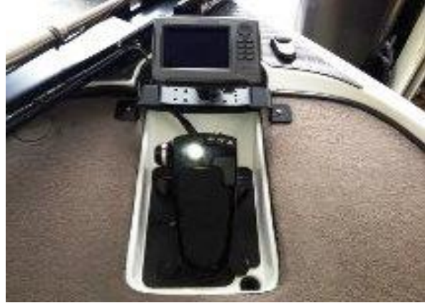
Triton Bow Mount Bracket