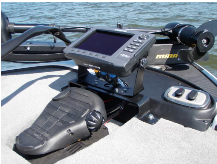
NITRO Z-7 Bow Mount Bracket