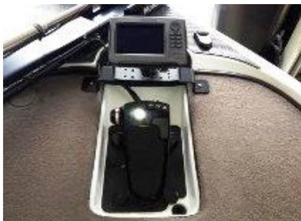
Triton Bow Mount Bracket