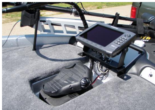
Phoenix Bow Mount Bracket