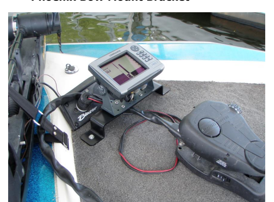
Blazer Bow Mount Bracket - On Deck Installation