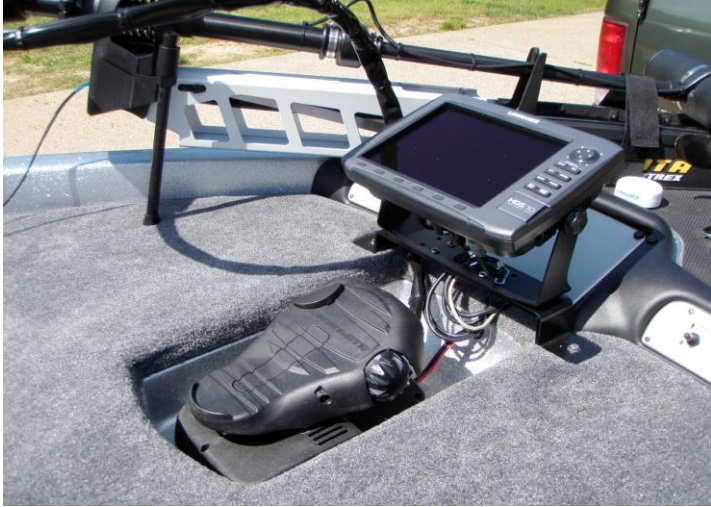
Phoenix Bow Mount Bracket