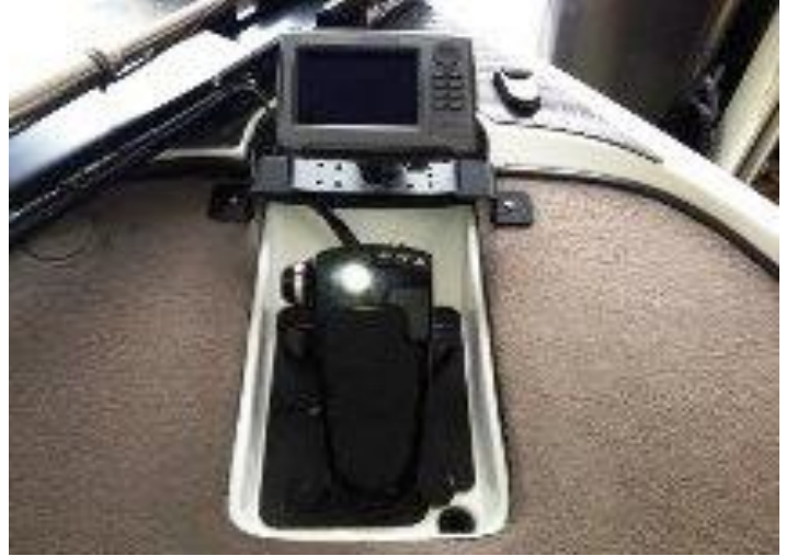
Triton Bow Mount Bracket