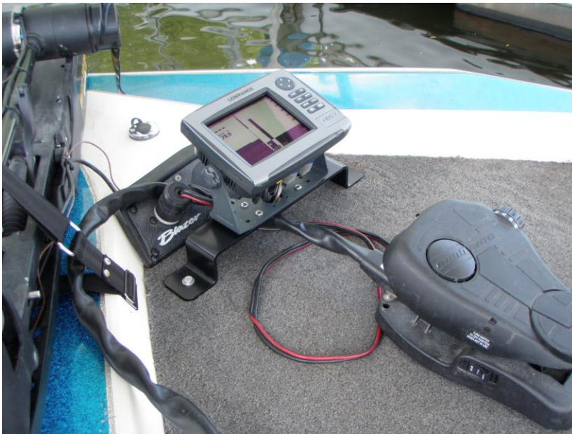
Blazer Bow Mount Bracket - On Deck Installation