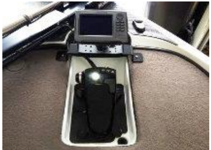
Triton Bow Mount Bracket