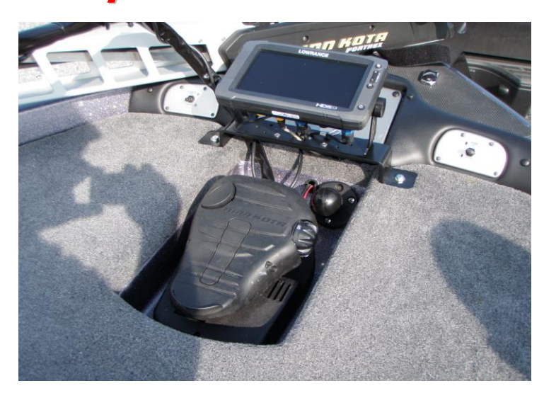
Phoenix 921 XP Bow Mount Bracket