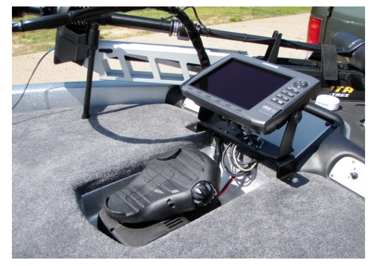
Phoenix 920 XP Bow Mount Bracket