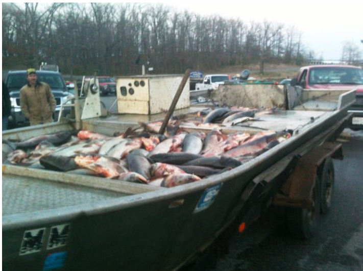
Literally a "Boat Load" of Carp