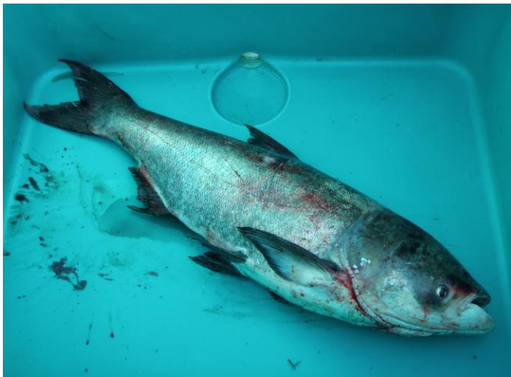
48 Pound Big Head Carp