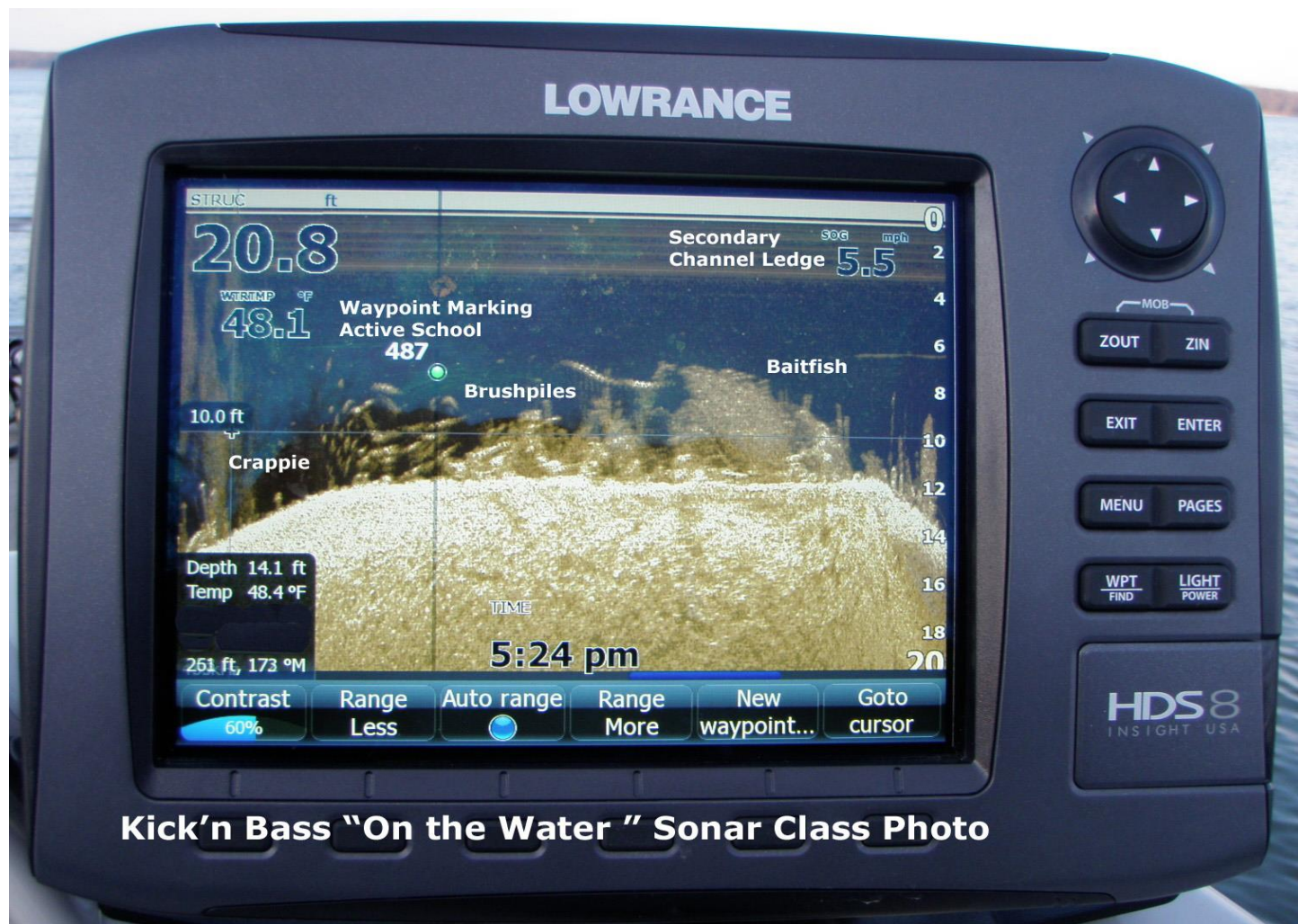
Kick'n Bass "On the Water " Sonar Class Photo