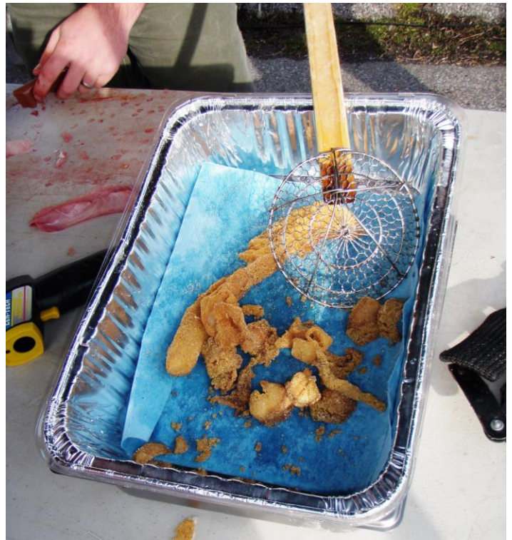
Very tasty and didn't last long either!