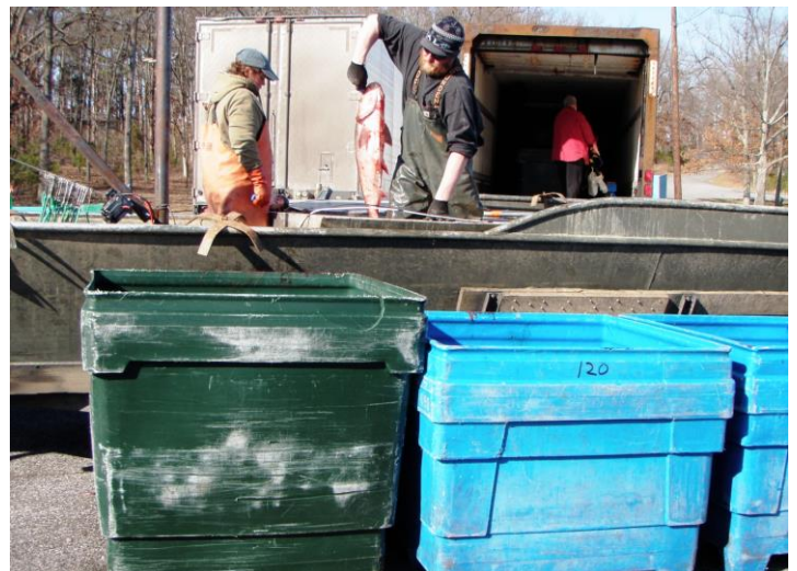
Carp Headed to the Scales