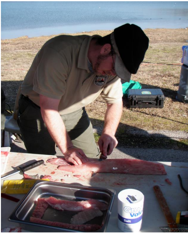
Preparing carp for the frying pan