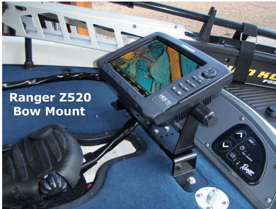
Ranger Z520 Bow Mount