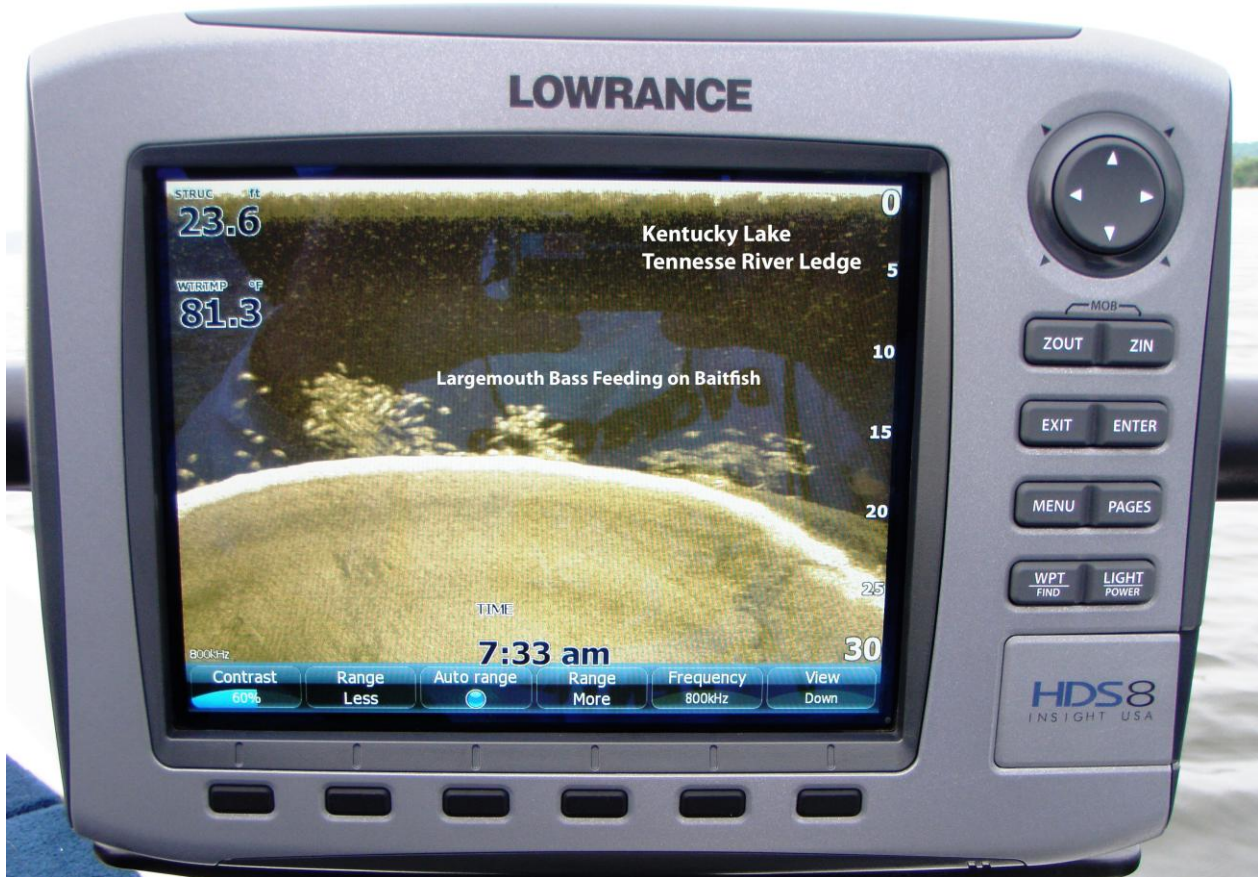
Bass feed more during the hot months than at any other time of the year. Right now, bass are schooled up and relating to structure. The screen shows a huge school of bass feeding on a long