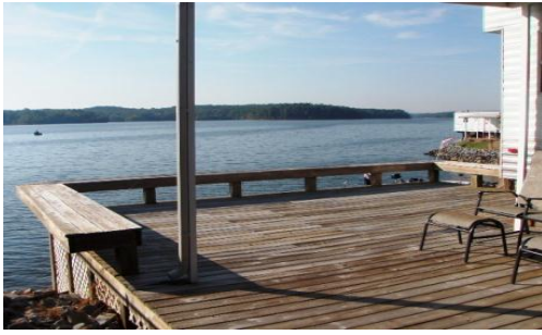
Fantastic View Overlooking the Lake