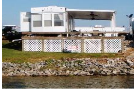
Choice Water Front Location