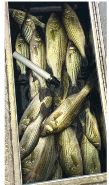
A mess of Whitebass caught on the KnB pontoon!

We have been pulling crankbaits a lot lately. The Jenko fishing Crappie crankbaits have been our go to baits. The Crappies have been changing their color preferences daily so started out with multiple colored cranks is your best bet. Then narrow down their color of choice as you fish. 1.8 mph has been my best speed about 12 feet down in 14 to 18 feet of water. Sometimes the