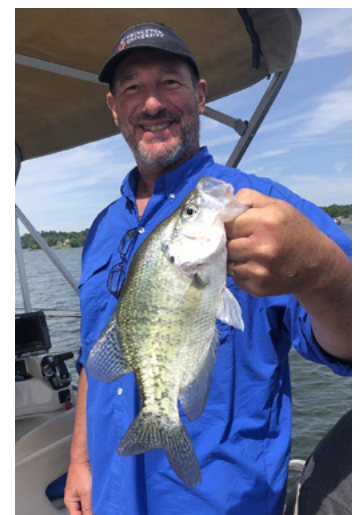
The Brucki family from orland Park caught some nice Crappies