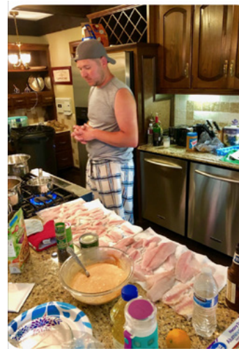
No one was left hungry tonight!!!!