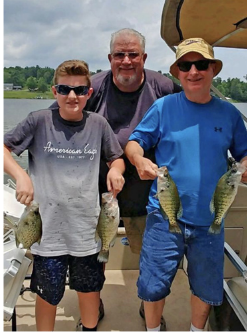
The Downey family from all over