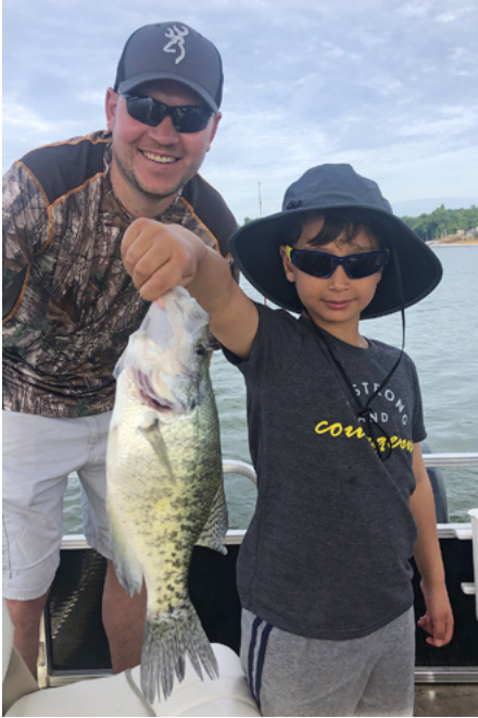
The Thiene family from Milwaukee

bay you caught them in yesterday is slow so keeping multiple areas to fish is essential. Main lake flats are picking up also. Keep moving and you'll find them. Deeper creek channels have started producing some big Crappies lately. There is A LOT of minnows and shad schooled up in the lake right now. Good for us but bad for the baitfish!!