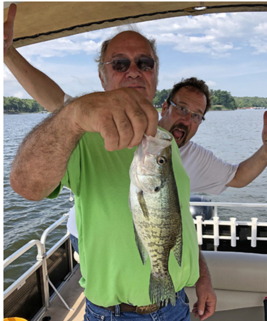
The Ridls had a fun day catching a mixed bag with the Captain!