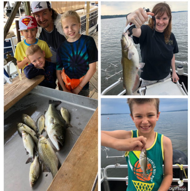
Bay family fishing fun!

The whitebass fishing has been more on than off especially on when the current has been heavy. The yellow bass have been great this year and both