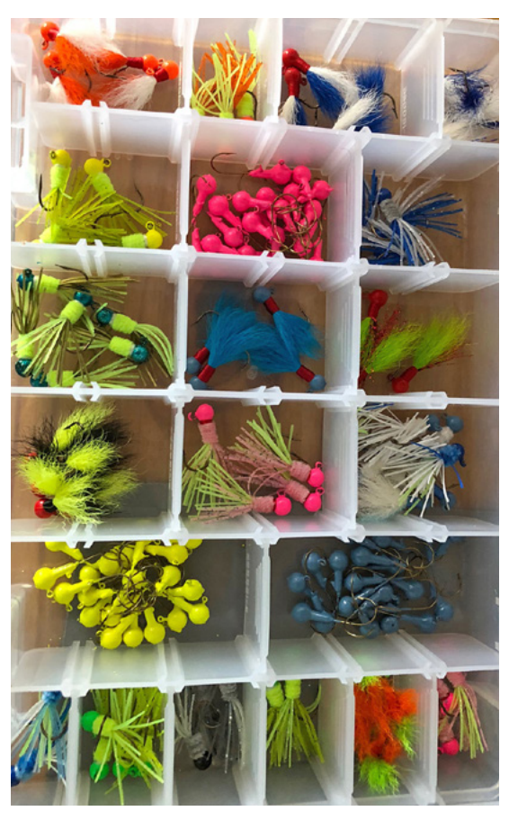
(rappie Hut Jigs come in a wide assortment of colors.