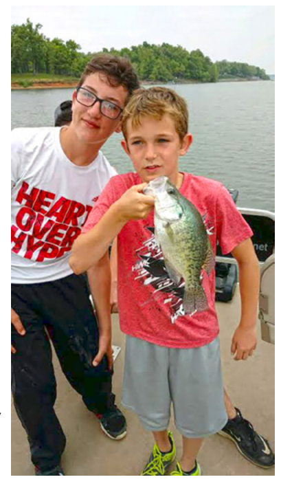
Two of the Knepp boys from Montgomery IN, showing off a nice crappie.

You can view the lake levels here: <a href="tva.gov/Environment/Lake-Levels/Kentucky">tva.gov/Environment/Lake-Levels/Kentucky</a>