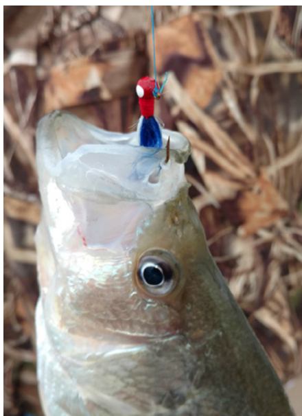
The Crappie Hut Jig that kept on catching!