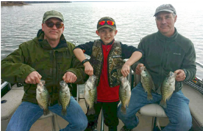
The Bennett Group from Milwaukee, WI