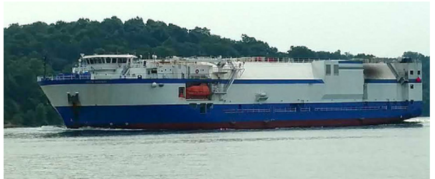
The Delta Mariner on the lake this week

Weather forecast is for highs in the mid to upper 80's for the next week with scattered thunderstorms on some days. Still pretty hot so bring alot of water and sunscreen for your ventures out in the lake (or beach!))! Water levels are stable for now but we have some possible weather events coming in. Fishing has been good for the last ten days or so and I expect that to continue. They blew up the old Eggner Ferry bridge this week and how fitting was it was to see the Delta Marina cruising by...the ship that knocked 322 feet of that bridge down in 2012.