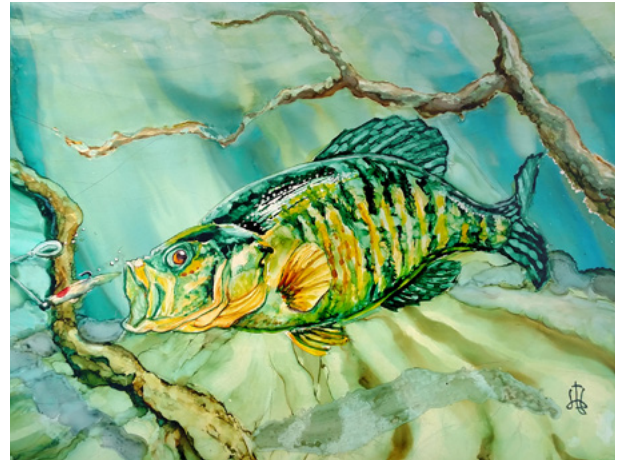
Rich's wife Diane's artwork

Crappies have settled up into their normal pattern on the main lake. Pulling Arkie crankbaits has produced some nice fish. I have been varying my trolling speed between 1.6 and 2.1 mph. No one color seemed to be favored this week. Fishing the deeper bays over brush and stake-beds with minnows has also produced some good catches. Having to sort through a bunch of short fish to find keepers is a good/bad situation.