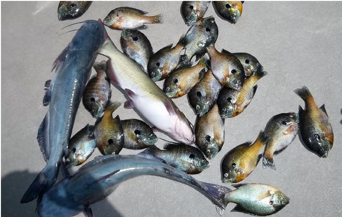
Nice mess of gills and cats on the toon last week!

I did not get the chance to fish for gills and redears this week but have seen nice baskets of both at the cleaning station. The young lady angler told me she had caught them with her daddy on crickets in 6 feet of water under a slip float.