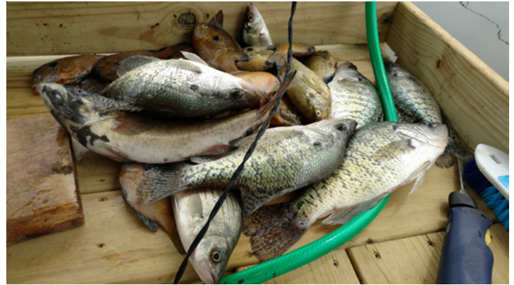
Nice mess from the KnB pontoon!

Catfish are still prespawn but are being caught from shallow to deep. A bunch have been caught by the KnB pontoon while redear fishing and also while pulling cranks. They are full of eggs that do not look ready to be dropped. They may be up shallow raiding spawning nests for the eggs and small fry to eat. Saw sauger and perch caught this week also.